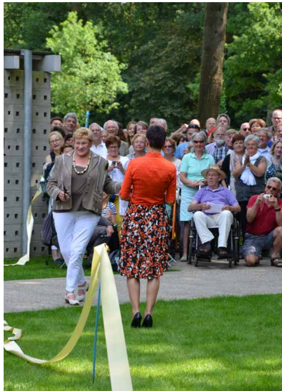
Start of the anniversary year and opening of the exhibition Top 75

From 7 December 2013 through 30 March 2014, the museum presented an exhibition entitled A One Day Walk , with some fifty works by Anthony Caro, Philip King, Richard Long, Hamish Fulton, Nicholas Pope, Barry Flanagan, Tony Cragg and Bill Woodrow. The exhibition