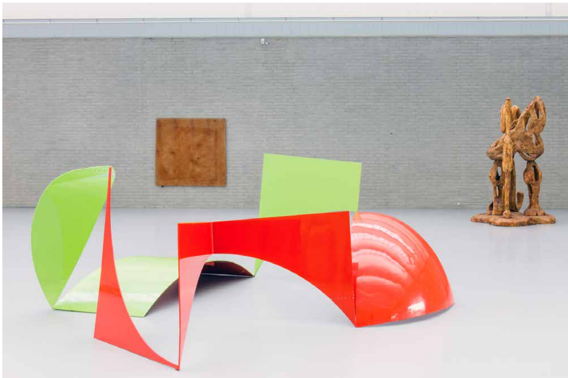
Exhibition A One Day Walk