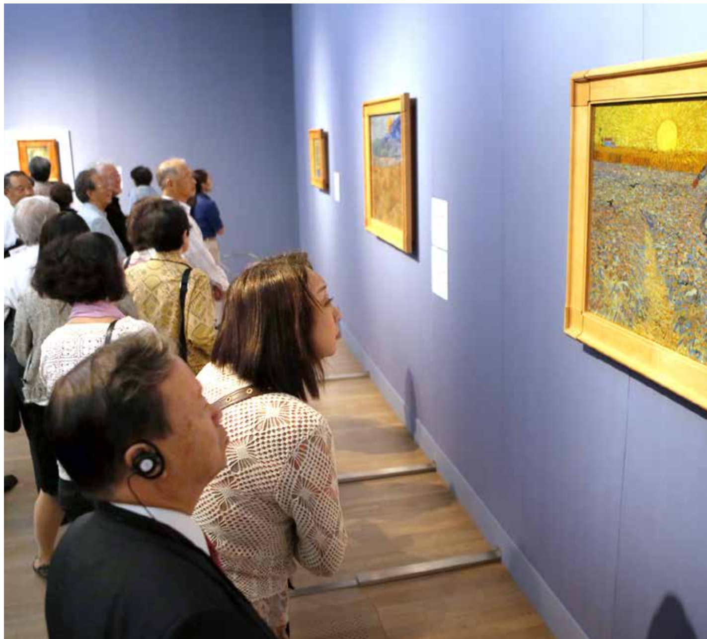
Exhibition Divisionism. From Seurat to Van Gogh and Mondrian in Japan

In 2013 there were two presentations outside the Netherlands with work from the museum collection. An exhibition ran until 17 March at the Pinacothèque de Paris entitled Van Gogh. Rêves de Japon (Van Gogh. Dreams of Japan ), with thirty works by Vincent van Gogh from the Kröller-Müller collection. Some 100,000 visitors attended the exhibition in 2013. On 3 October, the National Arts Centre in Tokyo, Japan started the exhibition Divisionism. From Seurat to Van Gogh and Mondrian . This exhibition mainly consisted of works from the collection of the Kröller-Müller Museum, with paintings (seventy-five) as well as works on paper (seventeen), augmented with several paintings from Japanese collections. The exhibition ran until 23 December and attracted 182,477 visitors. After Tokyo, the exhibition travelled to two other locations in Japan.