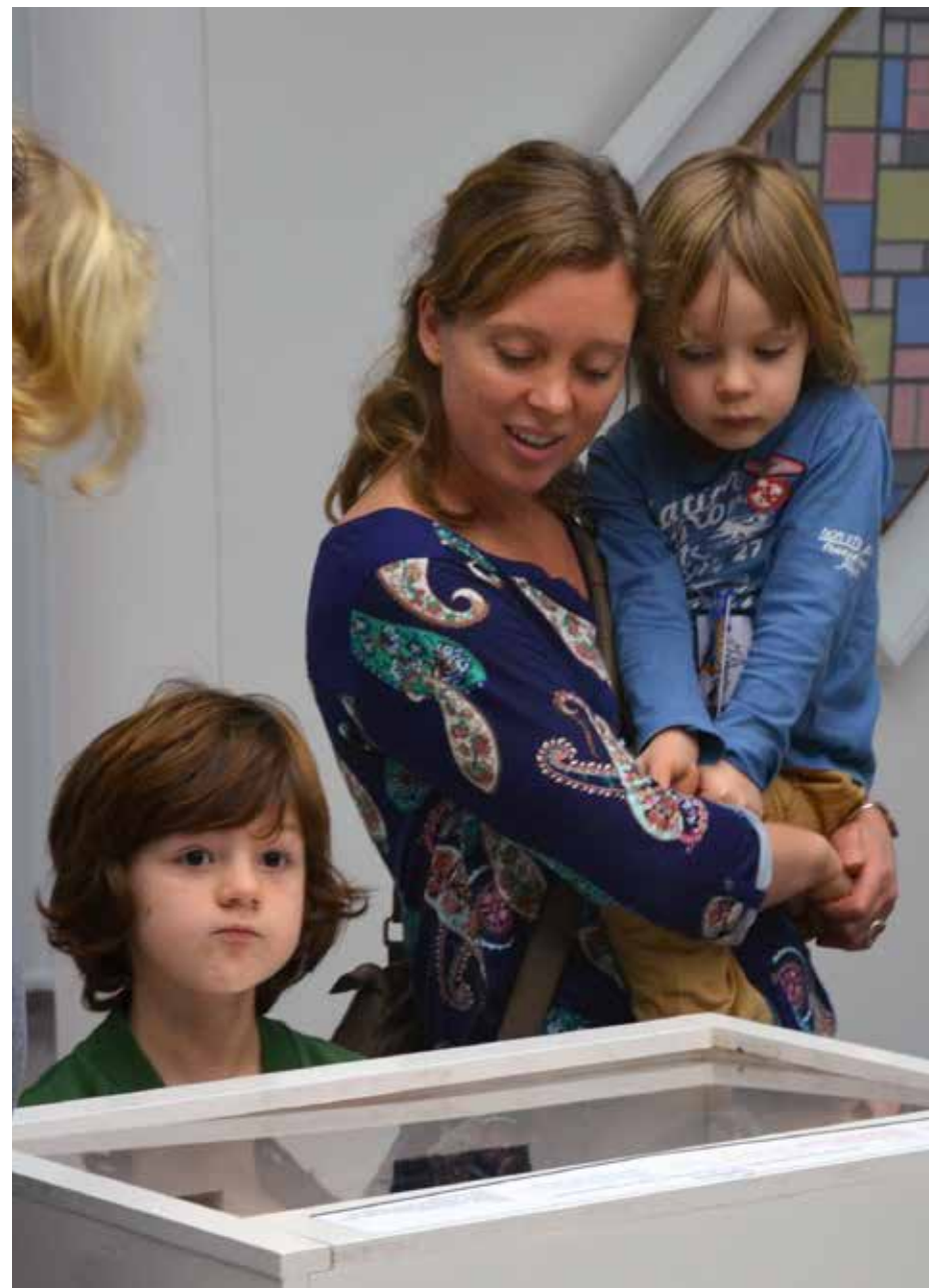
The Winter Games

The Gelderland Museum Day in October attracted 2,594 visitors, including 400 children, which made the Kröller-Müller the most visited museum during Gelderland Museum Day.