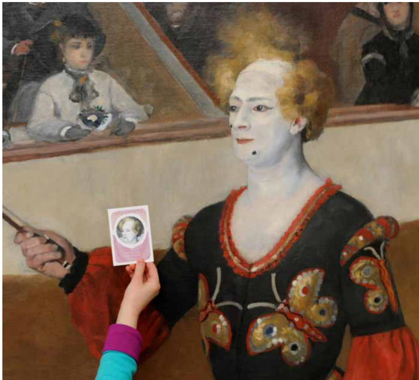
Detective Game: Auguste Renoir, Le clown musical , 1868

On 1 January 2012 the museum joined Museum Card for a trial period of two years. The museum sees the card as an important instrument to attract more Dutch visitors. In 2012 the museum received 71,992 visitors with a Museum Card, and in 2013 there were 83,596, which amounts to some 25% of the total number of visitors. The conclusion is that the past two years have already shown the added value of the Museum Card and that the collaboration will be continued.