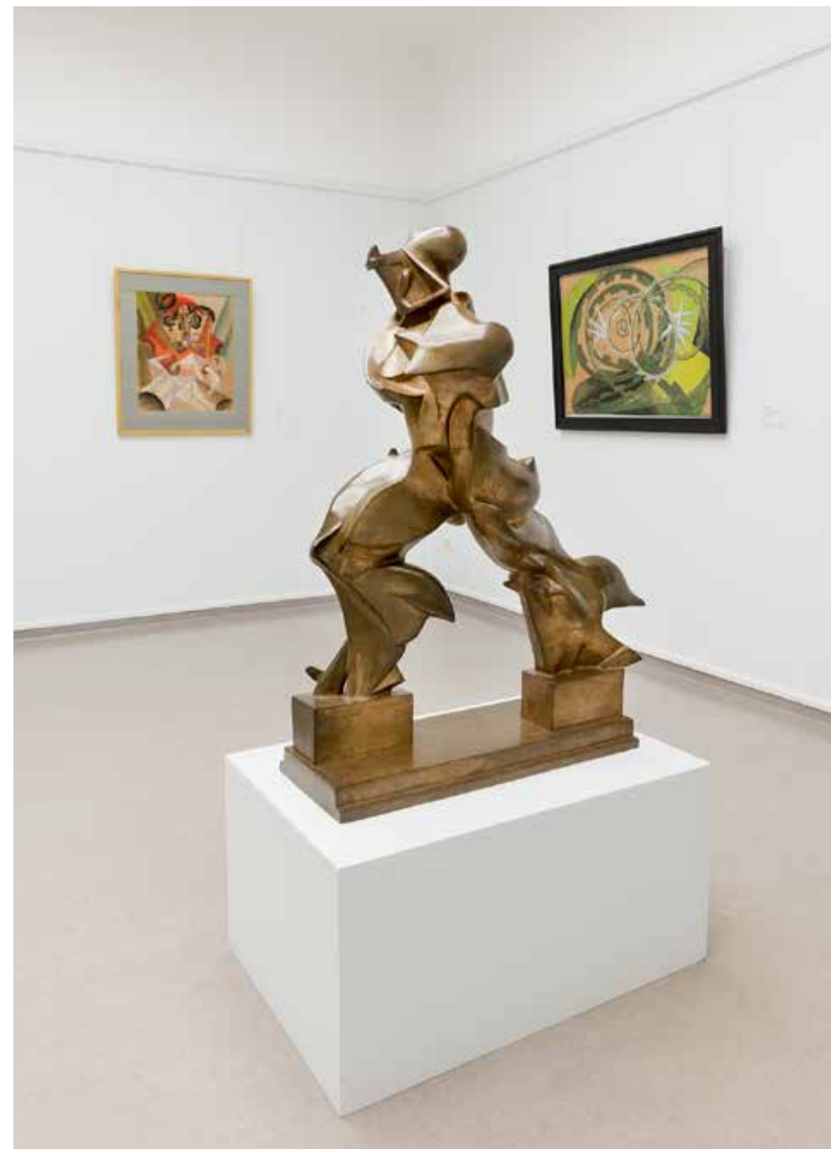
Forme rumore di motocicletta by Giacomo Balla in the new Futurism presentation

As part of the supportership of the Kröller-Müller Museum, the City of Ede provided contributions in the form of location hire, purchase of entrance tickets and the development of educational projects. The City also contributed € 10,000 (including VAT) to the Sweet Summer Nights.