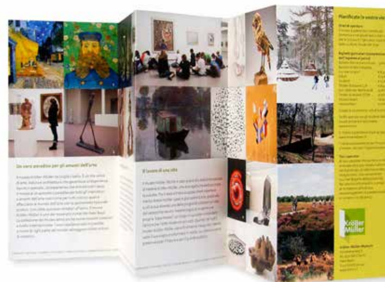
General folder, designed in the new visual identity