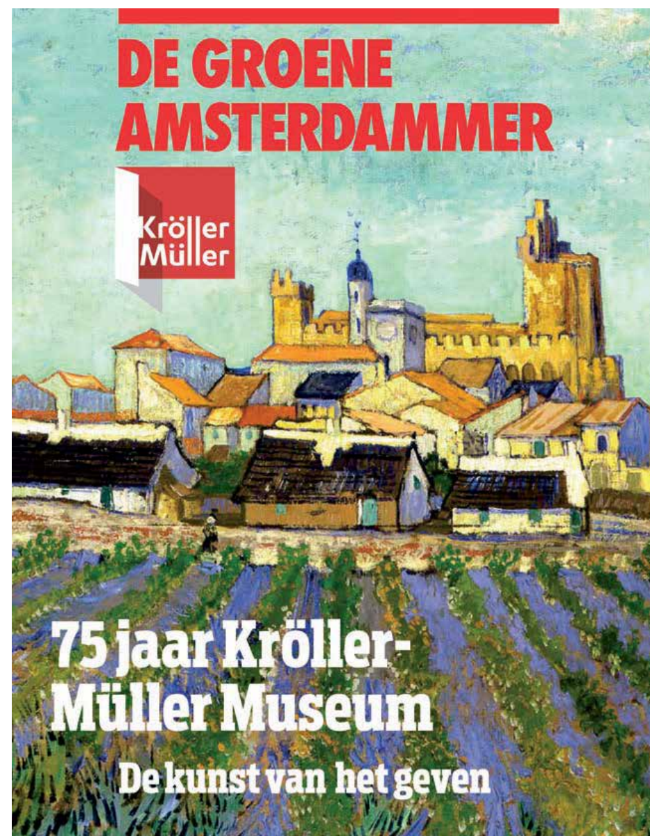
Special jubilee annex in De Groene Amsterdammer

On 12 July the Helene Kröller-Müller Fund was established, with as objective the providing of support in restorations, large exhibitions and educational projects of the Kröller-Müller Museum. The initiative to set up the Fund was taken by politician Alexander Pechtold and actress Johanna ter Steege. Just like the founders of the museum, Helene and Anton Kröller-Müller, this Fund calls on private individuals and companies to provide support for the museum. They can become a 'booker' or donor – Golden Booker, Silver Booker or Bronze Booker – by giving a one-time or (five-year) annual donation to the Helene Kröller-Müller Fund. ABN AMRO Bank is the founding partner together with Kröller-Müller Museum. Founding partners contributed to the start-up costs of the Fund. A 15-member Board of Recommendation actively assists in the acquisition of bookers. At the end of December 2013 eleven bookers were enrolled and six individual donors and companies had made a one-time donation.