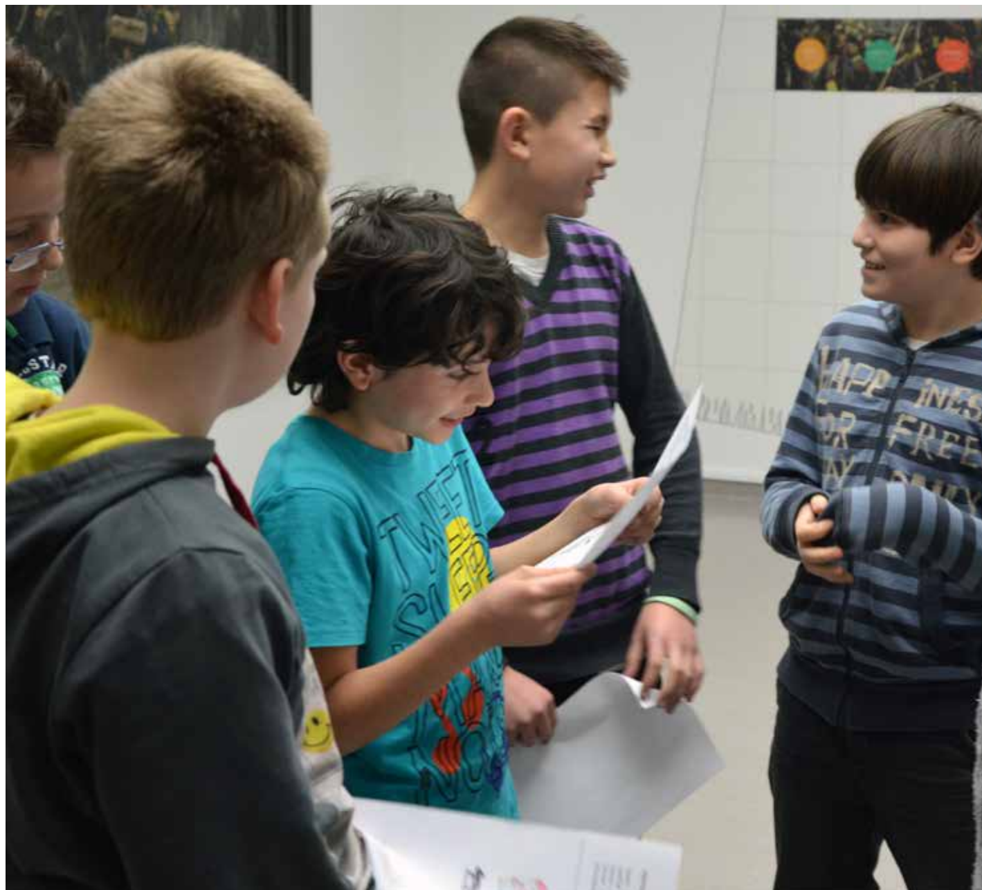
Pupils at work in the exhibition 10 Masterpieces 1001 Stories

This year the museum again provided different workshops and lectures on the current opportunities there are for art education, for the Pabo teacher-training institutes, teachers and ICCers.