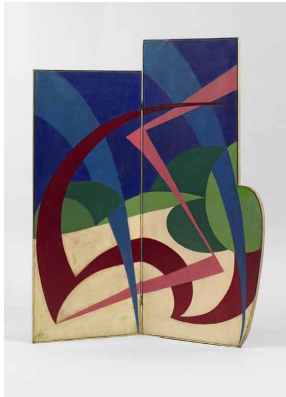
Paravento con linea di velocità (front), 1916-1917, Giacomo Balla

The most important acquisition in 2015 was Paravento con linea di velocità (1916-1917) by the Italian futurist