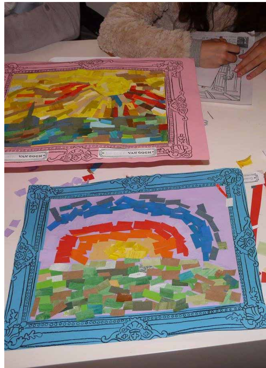
Result of workshop at the Gelderse Museumdag

In October the museum took part once again in the annual Gelderland Museum Day , with a creative workshop by Marja Meijer ( Make your own Van Gogh ) plus the new Museum Dice Game for families. The day drew 2,438 visitors, including around one hundred and fifty children.