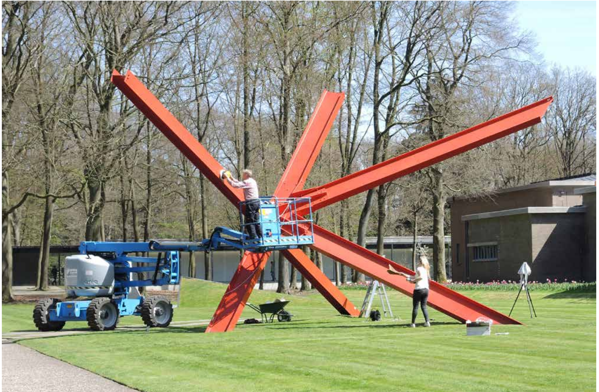
Conservation work on K-piece , 1972, Mark Di Suvero