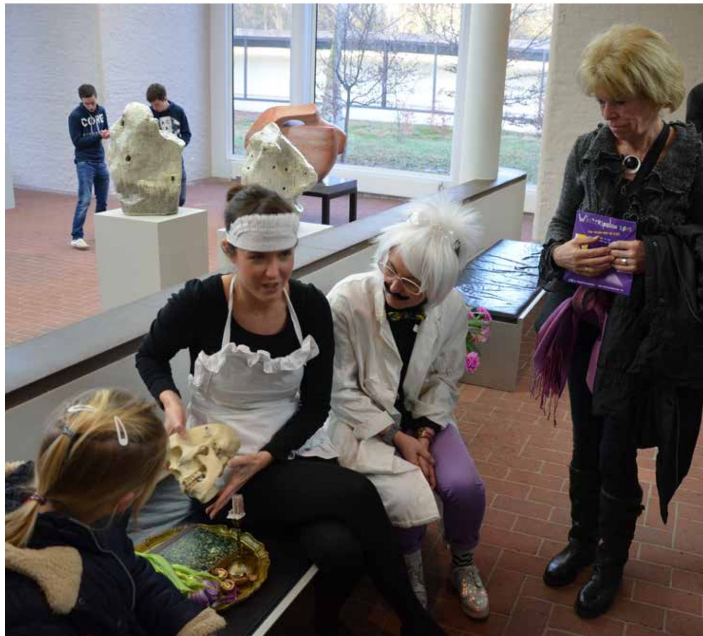
The Winter Games

In April the museum participated in the national Museum Week with the Mix Match family day , a special