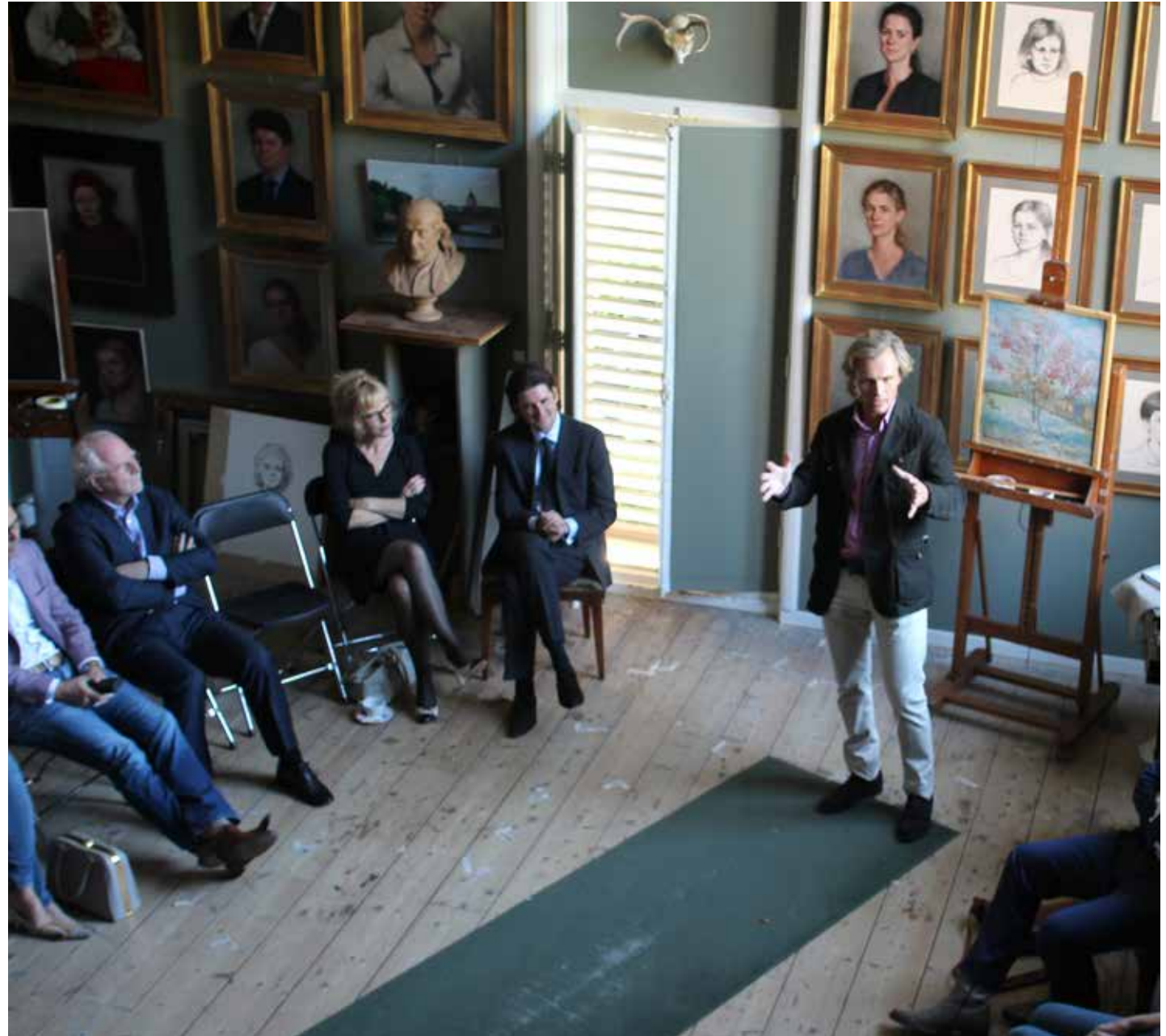
Meeting Helene Kröller-Müller Fund in former studio of George Breitner in Amsterdam

In summer 2015, the Helene Kröller-Müller Fund Foundation and the older Kröller-Müller Fund Foundation were merged to form a single supporting foundation with the name Helene Kröller-Müller Fund Foundation. After more than two years of active fundraising, the number of donors (private individuals, companies and funds) and project partners has risen to a total of eighty-one. At year-end 2015, the Helene Kröller-Müller Fund had €678,000 available for its three objectives: exhibitions, education and restoration. The commitments through to 2020 in the form of regular donations amount to more than one million euros.