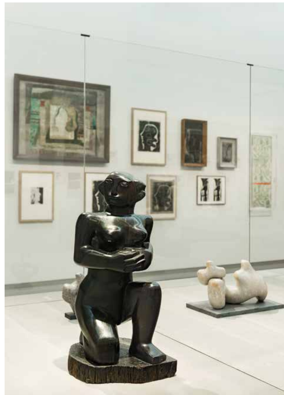
Installation view of exhibition: Barbara Hepworth: Sculpture for a Modern World

The most important exhibition of the year was devoted to Barbara Hepworth (1903-1975), one of the most successful sculptors of the twentieth century. The exhibition gave an overview of her entire oeuvre, from the modest sculptures in stone and wood from her early years to the ambitious bronze works from the fifties and sixties. Organised in collaboration with Tate Britain in London and Arp Museum Bahnhof Rolandseck in Remagen.