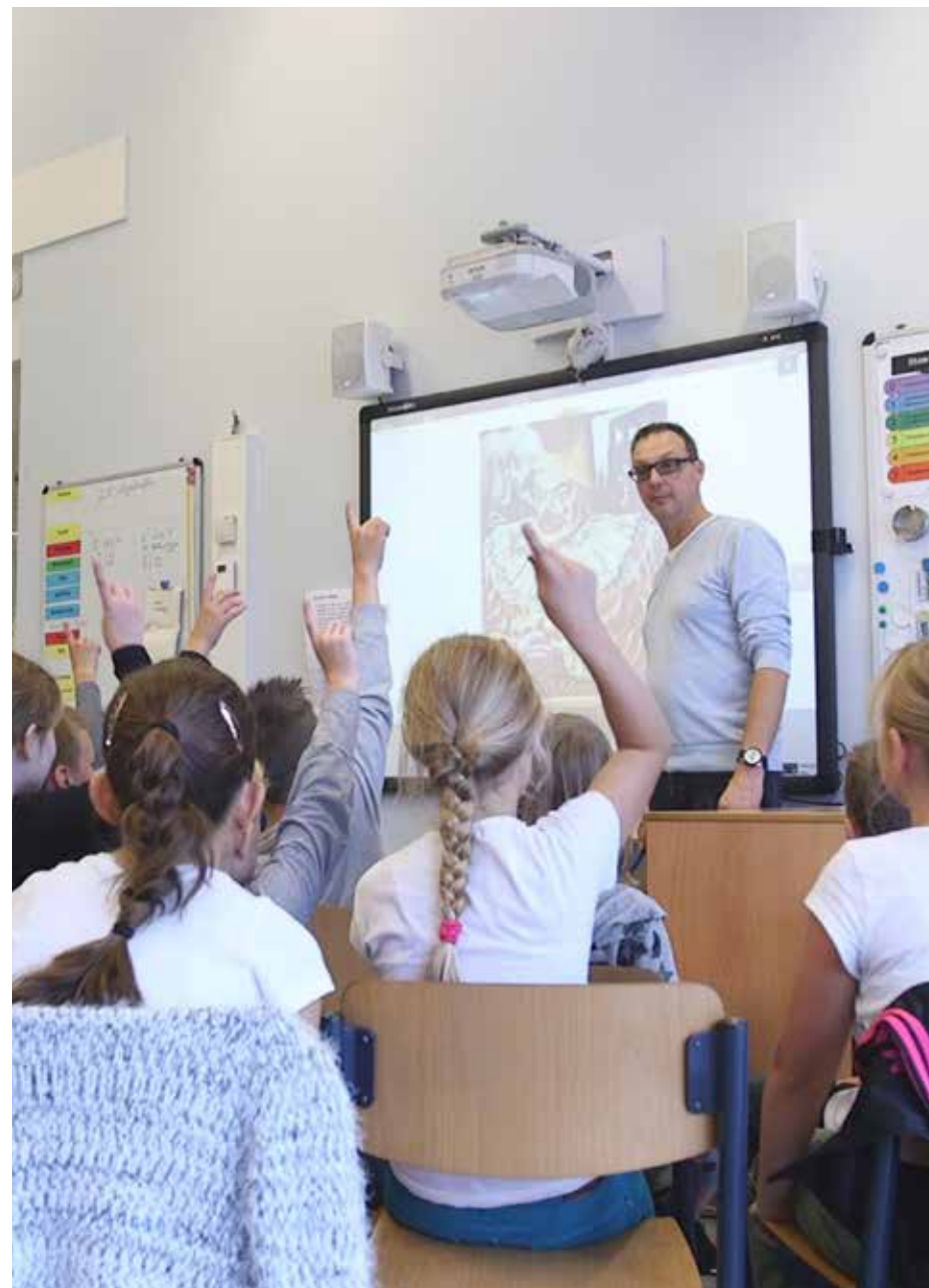
Digital block calendar in the classroom

The museum is collaborating with the Lions Appelthorn and the municipality of Apeldoorn to develop an Elke dag kunst (Every day art) 'digital block calendar' for primary schools in Apeldoorn. The municipality of Apeldoorn and members of Lions Appelthorn are funding part of the