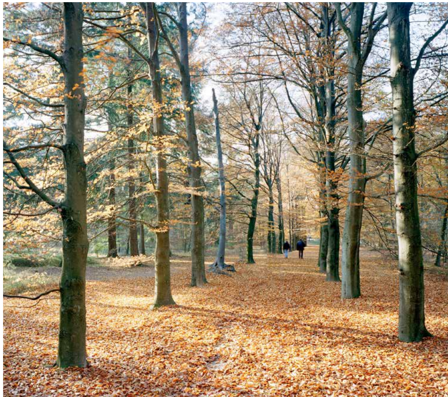
Autumn in the sculpture garden with Faggio di Otterlo , 1987-1988, by Giuseppe Penone