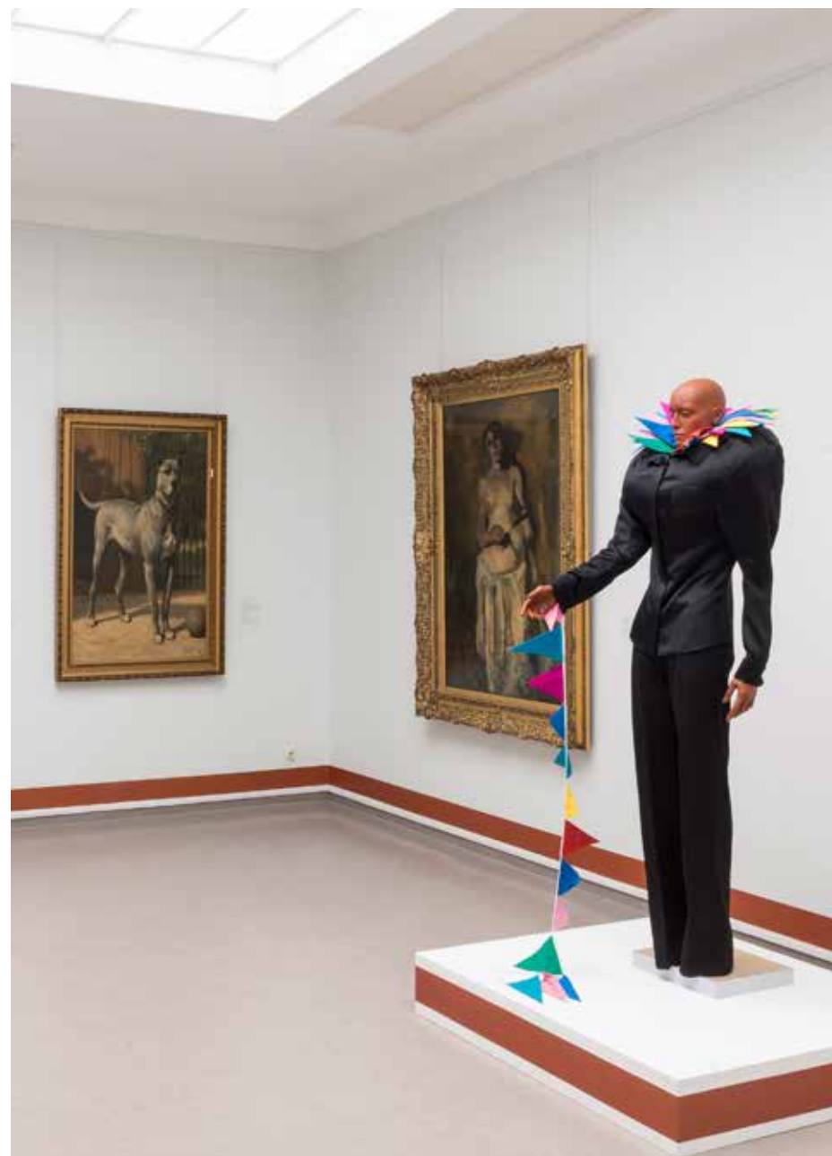
Installation view of exhibition: Mix Match Museum