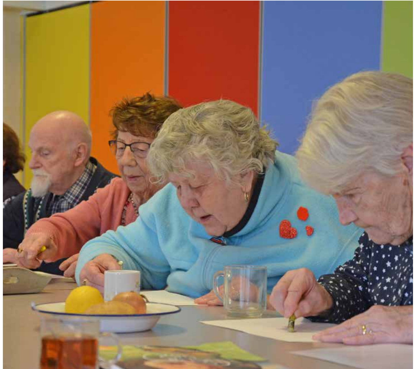
Workshop: Art makes the (wo)man

being added to the 'philosophy team'. In 2015 the team guided fifteen schools during their visit to the museum. The team also put on five workshops for schools, two study days for teachers, four informational meetings and the workshop Kunst Maakt de Mens (Art makes you) for senior citizens (70+), in collaboration with the Van Gogh Museum.