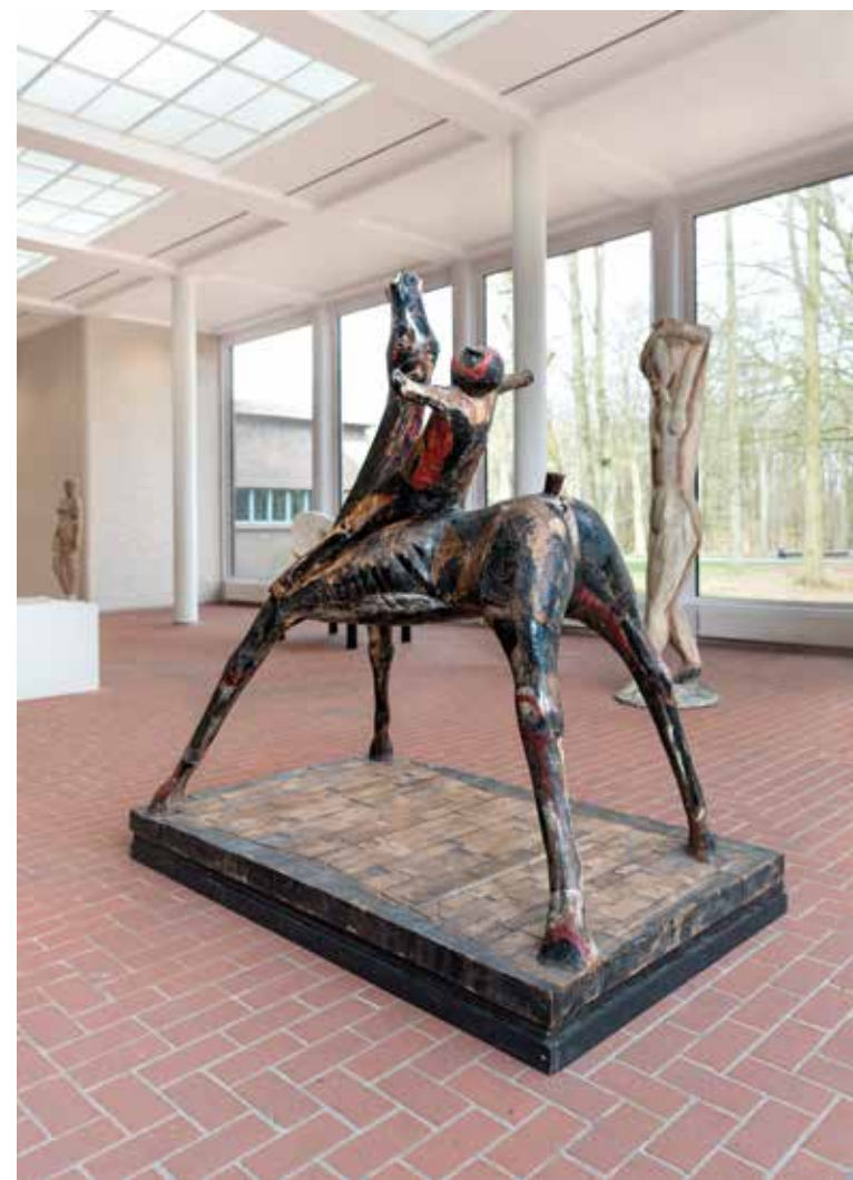
Sculpture gallery with Horse and rider , 1951 – 1955, from Marino Marini in the foreground

The Kröller-Müller Museum is a place where things of beauty come together. The unique combination of art, nature and architecture guarantees visitors a truly unforgettable experience. An experience that arouses all the senses. The museum is a paradise for both seasoned art lovers and objective newcomers. Nowhere else in the world is the enjoyment of art so intense, due to the phenomenal collection and the beautiful location in the heart of nature. With more than 400,000 visitors a year, the Kröller-Müller Museum is one of the most popular museums in the Netherlands. The collections are also a huge international success. Masterpieces on loan attract millions of visitors throughout the world.