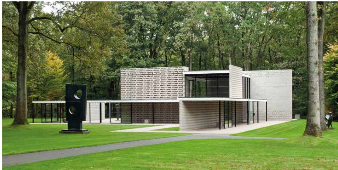
Rietveld Pavilion with work by Barbara Hepworth