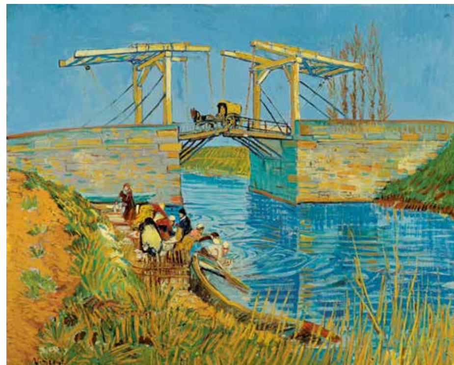
Vincent van Gogh, Bridge at Arles (Pont de Langlois) , March 1888