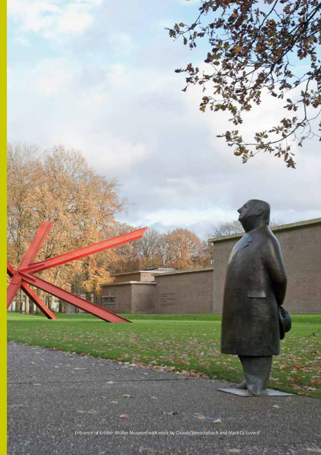
Entrance of Kröller-Müller Museum with work by Oswald Wenckebach and Mark Di Suvero