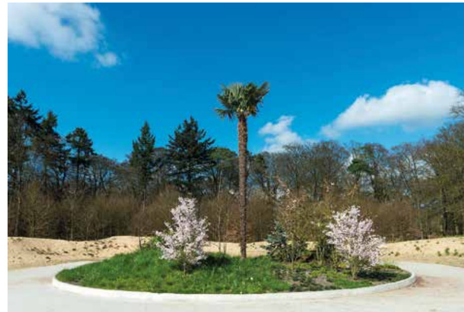
Pierre Huyghe, La Saison des Fêtes, 2010 (execution 2016), photo: Walter Herfst

The museum is set in one of Europe's largest sculpture gardens. An outdoor gallery covering 25 hectares, in which modern sculptures blend into the natural background. The garden serves as a backdrop for more than 160 sculptures by prominent artists, from Aristide Maillol to Jean Dubuffet, and from Marta Pan to Pierre Huyghe. It would be hard not to enjoy the setting, not to be drawn in by the sculptures and the natural beauty. Stretch out on the grass, enjoy a picnic or simply run around; there are countless ways to enjoy the sculpture garden.